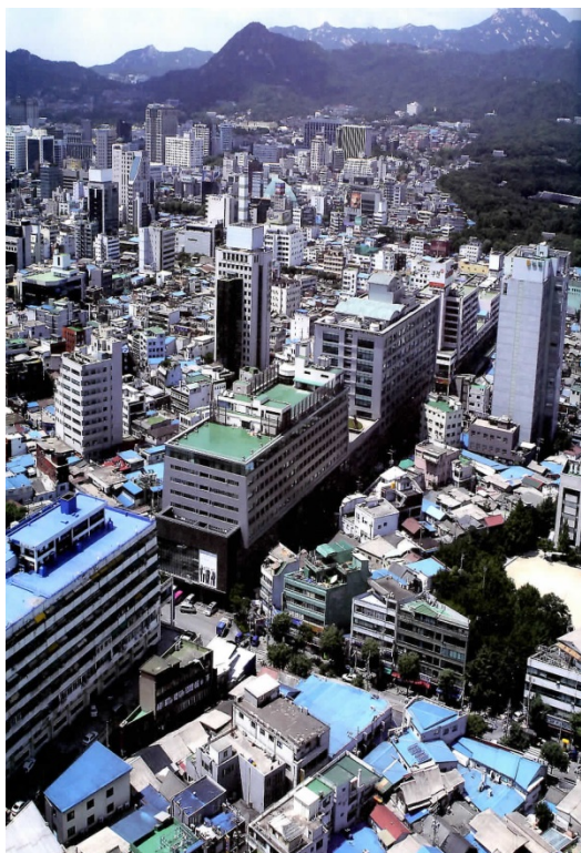
<Figure 1> A View of the Sewun Mall