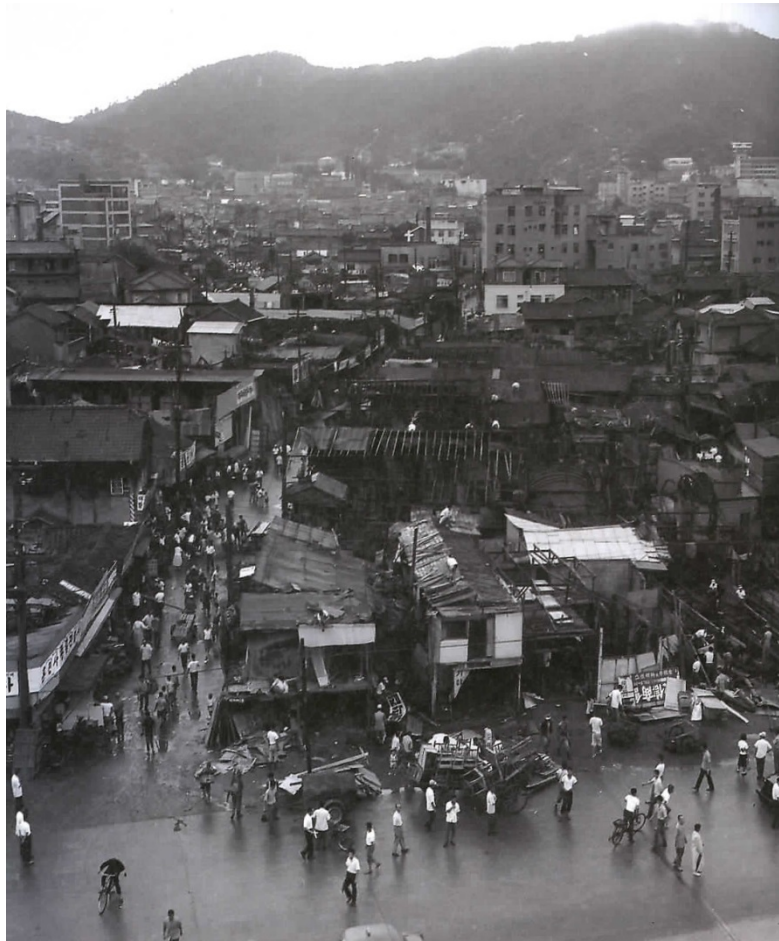
<Figure 2> Inhyeon-dong Area