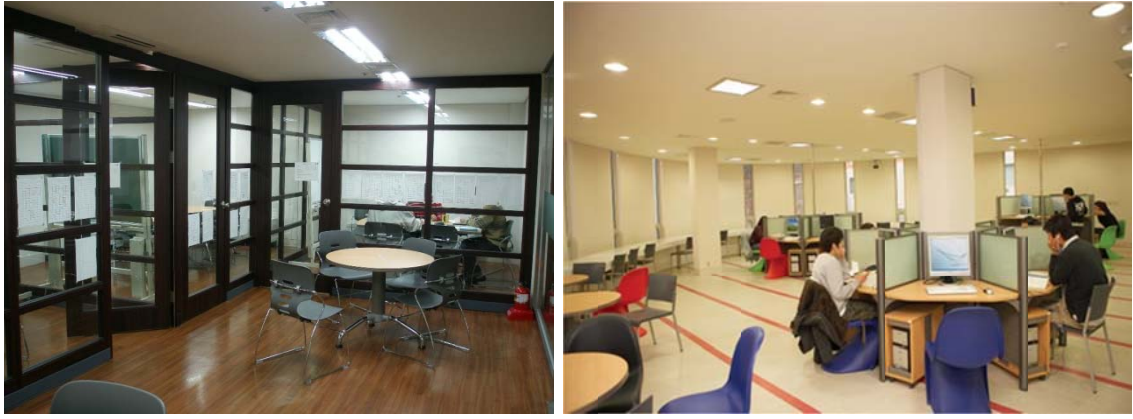
<Seminar Room and Internet Café>