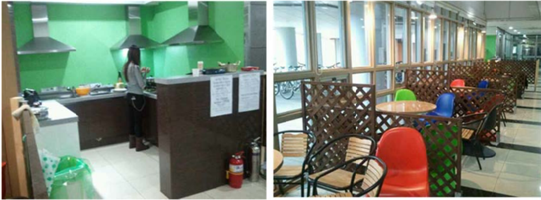
<Community Kitchen & Cafeteria>

The Dormitory and International House provides coin operated laundry rooms and a gym for its residents' use. These are located on the basement floor and open 24 hours. Seminar rooms, student lounges, and an internet café are also available for the residents.