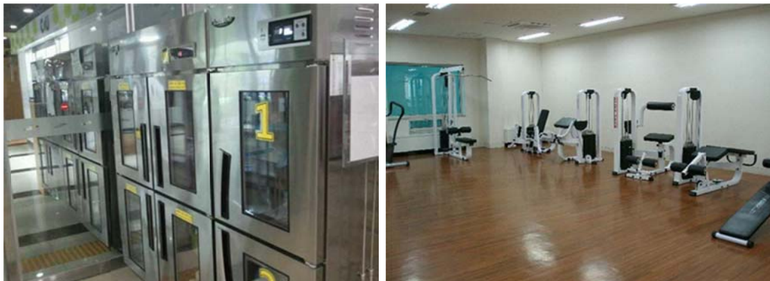
<Laundry Room and Gym)

The Dormitory and International House provides coin operated laundry rooms and a gym for its residents' use. These are located on the basement floor and open 24 hours. Seminar rooms, student lounges, and an internet café are also available for the residents.